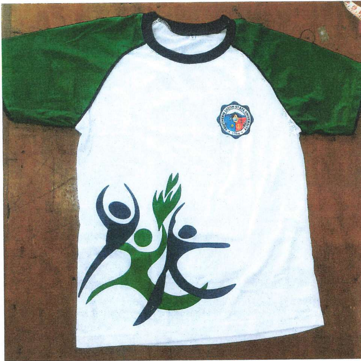
Front Bodice of PE T-shirt for college students with SLSU logo in the left bustline 2 ½ x 2 ½ inches. Round collar with 1/2" black piping. The textile for T-shirt is CVC 50-50 cotton. IHK logo in the lower right side of shirt 12" x 12" semi rubberized print.